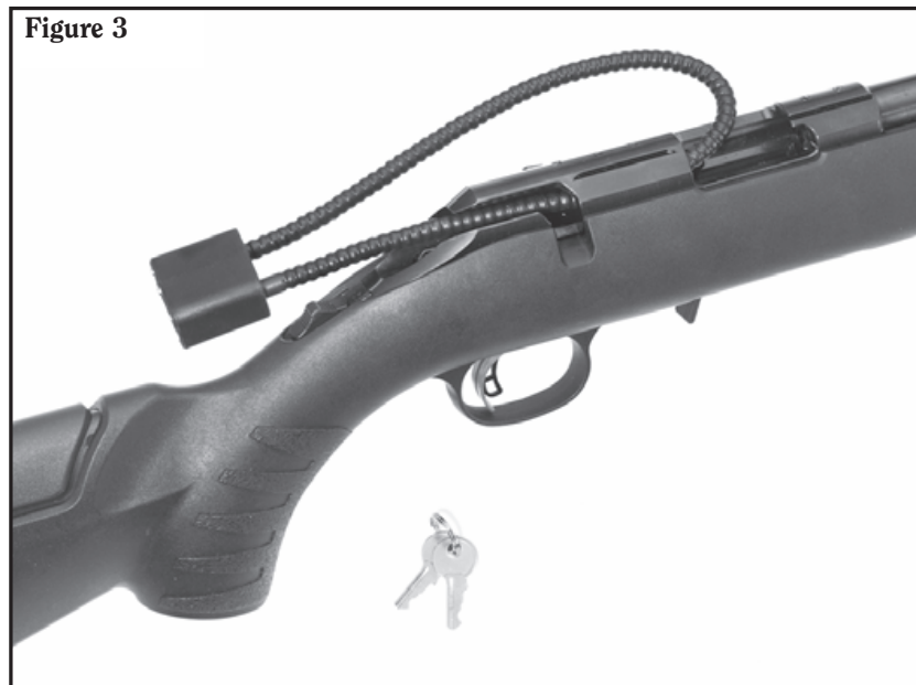
Correct Installation of Lock For RUGER AMERICAN RIMFIRE®